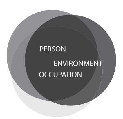
Diagram 2: Optimal P-E-O congruence

few weeks have produced the least amount of pain he can remember, and he fears that a return to his original job will result in losing his gains in reduced pain, improved sleep, and improved tolerance to a variety of physical activities.