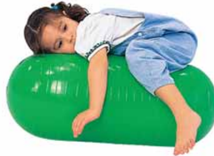
Gym Roll, Item #s 38444 & 38445