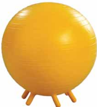
Football, Item #s 6706 & 6608

This is a great tool for beginning practitioners to use in therapy. The amount of control and coordination needed to manage by the practitioner is much less than with a regular therapy ball.