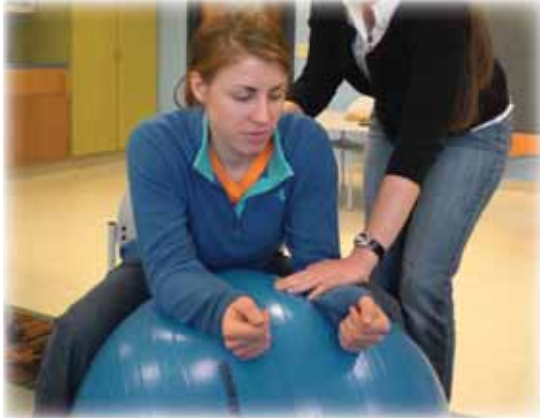
Body Ball, Item #s 2677, 2679, & 2690